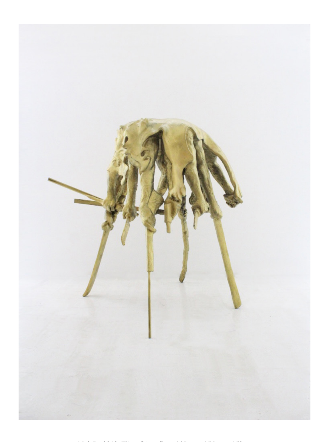
M.O.B., 2019, Fibre Glass Cast, 145cm x 156cm x 150cm