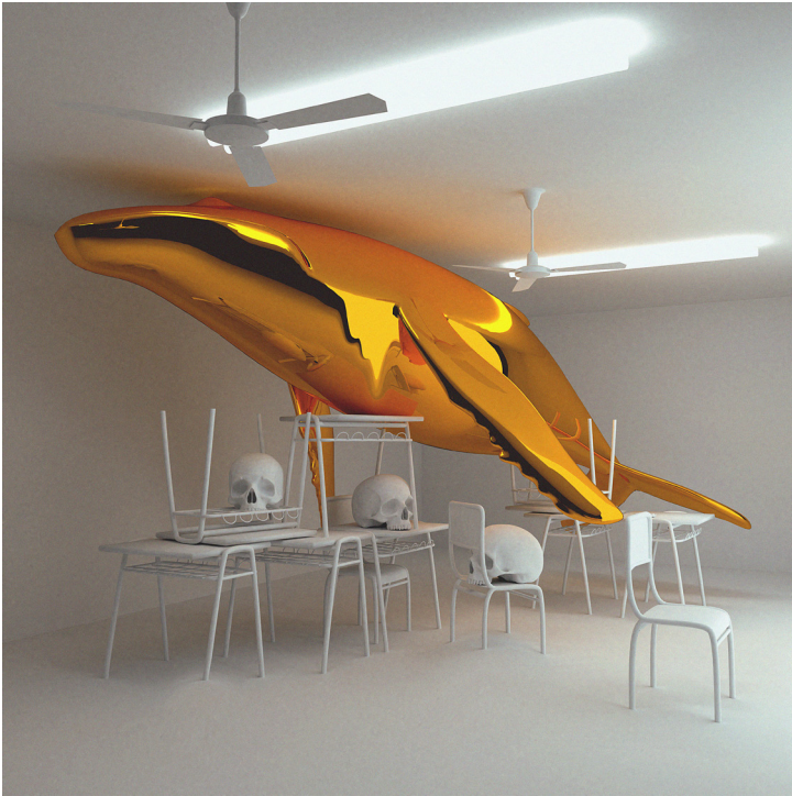
MUVINDU BINOY, God Is A Mesh VI , 2019, Print on Matt Archival Photo Paper, 58cm x 58cm