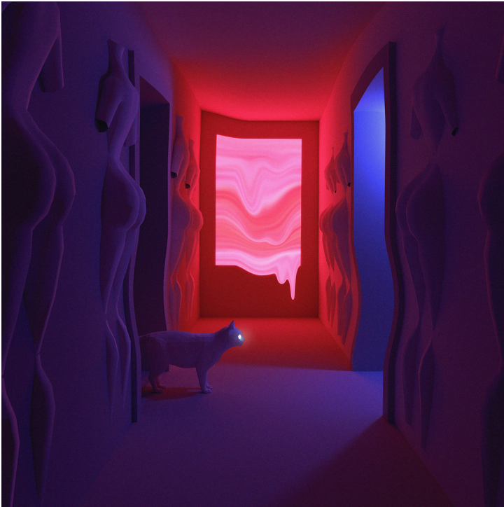
MUVINDU BINOY, God Is A Mesh II , Print on Matt Archival Photo Paper, 58cm x 58cm