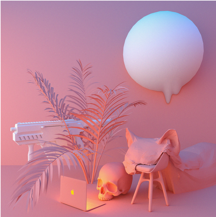
MUVINDU BINOY, God Is A Mesh III , 2019, Print on Matt Archival Photo Paper, 58cm x 58cm