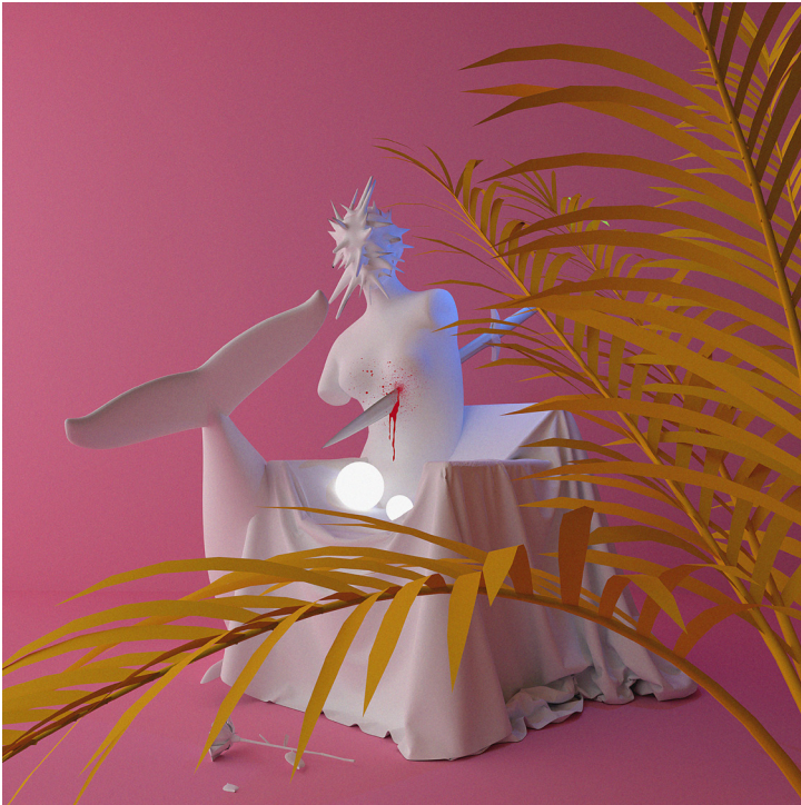
MUVINDU BINOY, God Is A Mesh V , Print on Matt Archival Photo Paper, 58cm x 58cm