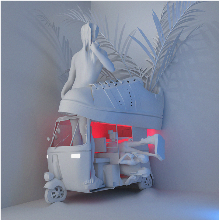
MUVINDU BINOY, God Is A Mesh IV , Print on Matt Archival Photo Paper, 58cm x 58cm