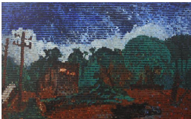
Chandraguptha Thenuwara, Neo-Glitch Inescapable Landscape III , (2025), Acrylic on Canvas, 132 x 208 cm

His work is held by several institutional collections including; Los Angeles County Museum of Art (LACMA), USA; The Fukuoka Asian Art Museum, Japan; Museum of Udmurtia Izhevsk, Russia; John Moores University Art Collection, Liverpool, UK and The Queensland Art Gallery, Brisbane, Australia.