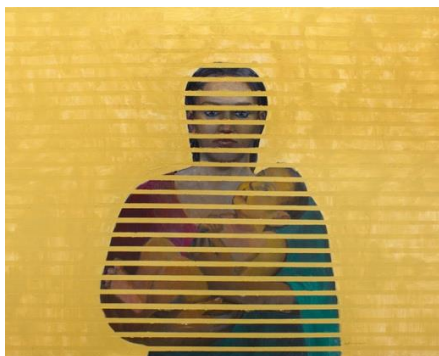
Chandraguptha Thenuwara, BLINDS: Hope , (2021), acrylic on canvas, 92 x 153 cm

Thenuwara's work has been featured in Art Dubai Modern, Dubai (2024); Kiran Nadar Museum of Art, Delhi (2023); Ishara Art Foundation, Dubai (2023); Sharjah Art Foundation, Sharjah (2022); Frieze, London (2022); Personal Structures , European Cultural Centre, Venice (2022); and also at the landmark moving exhibition, Cities on the Move (1997 - 99) curated by Hans Ulrich Obrist and Hou Hanru.