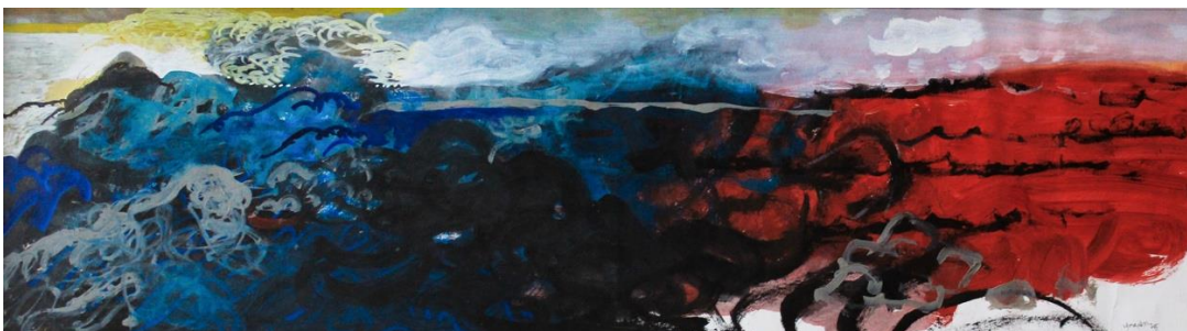
Jagath Weerasinghe, Under the Dark Sky: The Red Sea , (2025), Acrylic on Paper, 26 x 88 cm

Weerasinghe's work has been exhibited extensively at Baik Art Gallery, Los Angeles; Khoj, New Delhi; Serendipity Arts Festival, Goa; Colombo Art Biennale, Colombo; Asia House, London; Museum fur Volkerkunde Wien, Vienna; Singapore Art Biennale; Asia Pacific Triennial, Brisbane and the Fukuoka Asian Art Museum, Japan.