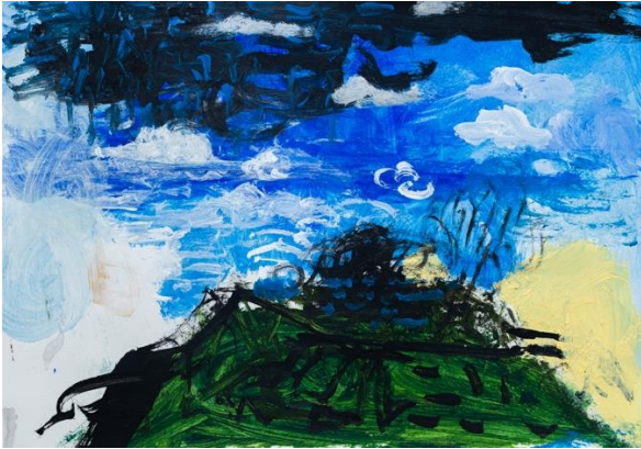
Jagath Weerasinghe, The Troubled Land (2025), acrylic on paper, 29 x 42 cm

Jagath Weerasinghe (b. 1954) is another pivotal figure in contemporary Sri Lankan art and has been a significant driving force in its development since the early 1990s. Weerasinghe's work is marked by a frenzied, passionate expressiveness highlighted through intense gestural brushwork.