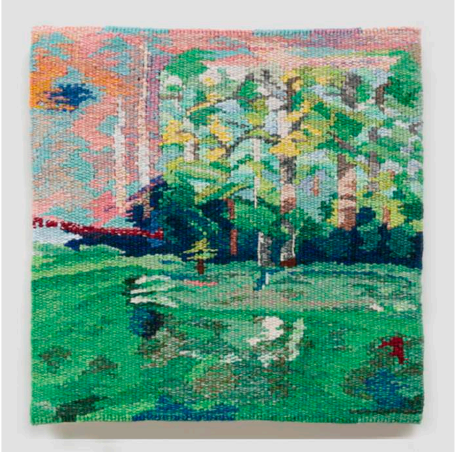
Weligama Garden I , 2017, Tapestry, 30cm x 30cm