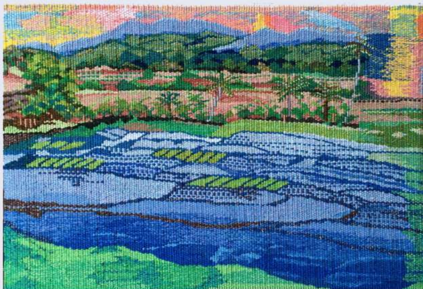
Paddies near Hanguranketha, 2018, Tapestry, 33.5cm x 50cm