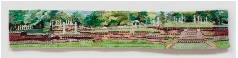
The Western Monasteries - Anuradhapura I, 2017, Tapestry, 9cm x 58cm