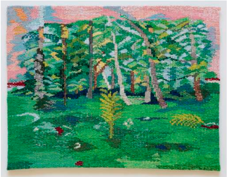
Weligama Garden II , 2019, Tapestry, 30cm x 39cm