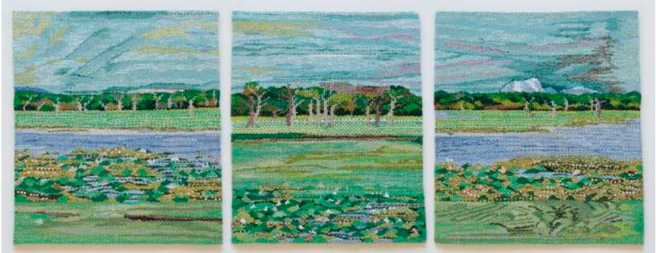
Yala , 2018, Tapestry, 38cm x 31cm (x2) & 38cm x 29cm