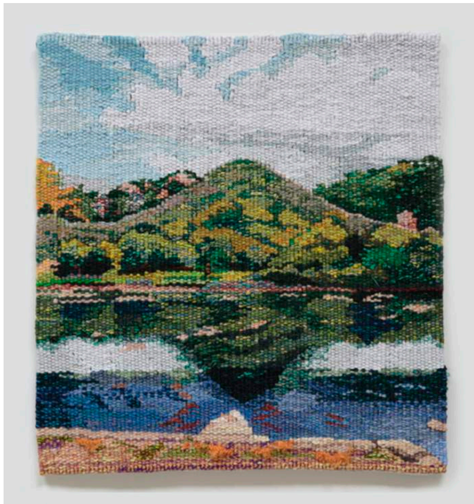
Kaludiya Pokuna , 2017, Tapestry, 30cm x 30cm