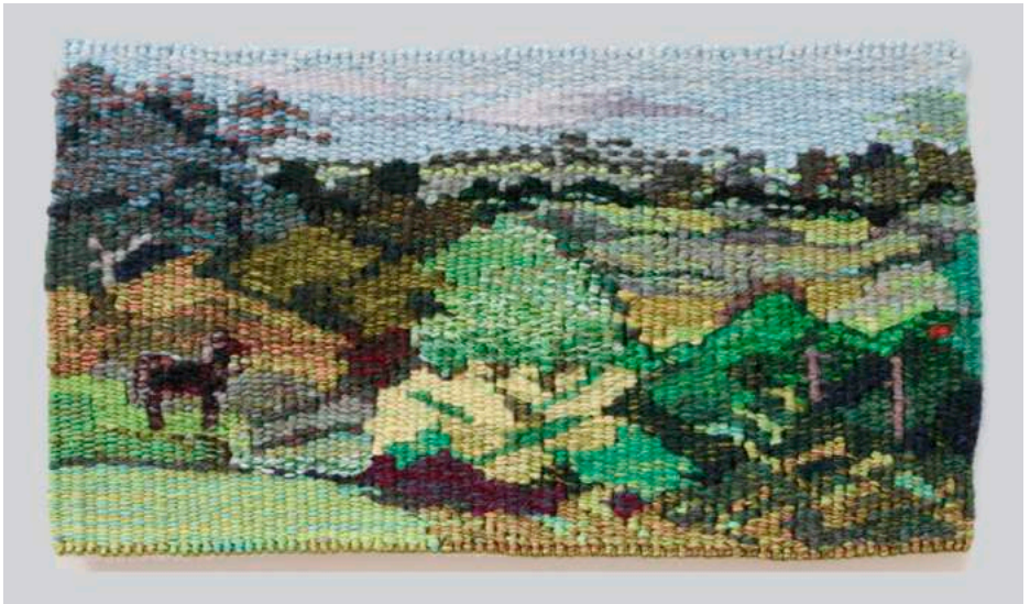
Brief Garden , 2013, Tapestry (woven en plein air), 11cm x 20cm