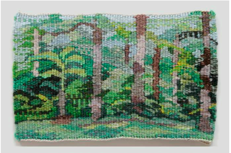
Garden near Weligama , 2011, Tapestry (woven en plein air), 11cm x 18.5cm