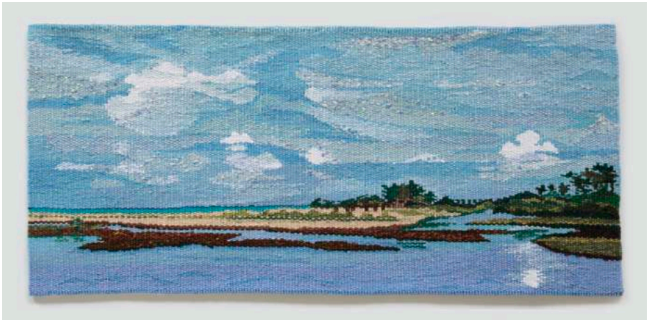
Kalpitiya Lagoon and Sea , 2017, Tapestry, 27cm x 59cm