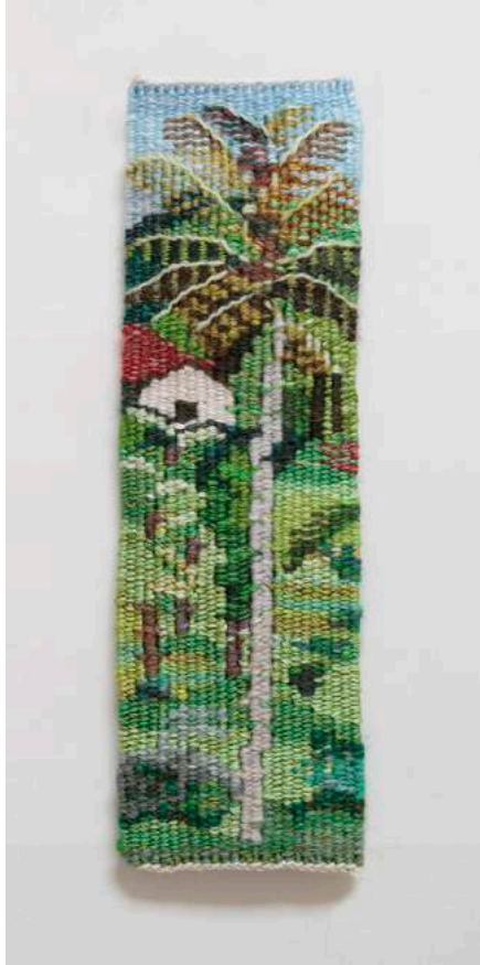
Digana View , 2011, Tapestry (woven en plein air), 17.5cm x 8.5cm