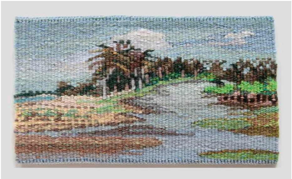
Kalpitiya , 2011, Tapestry (woven en plein air), 11cm x 19cm