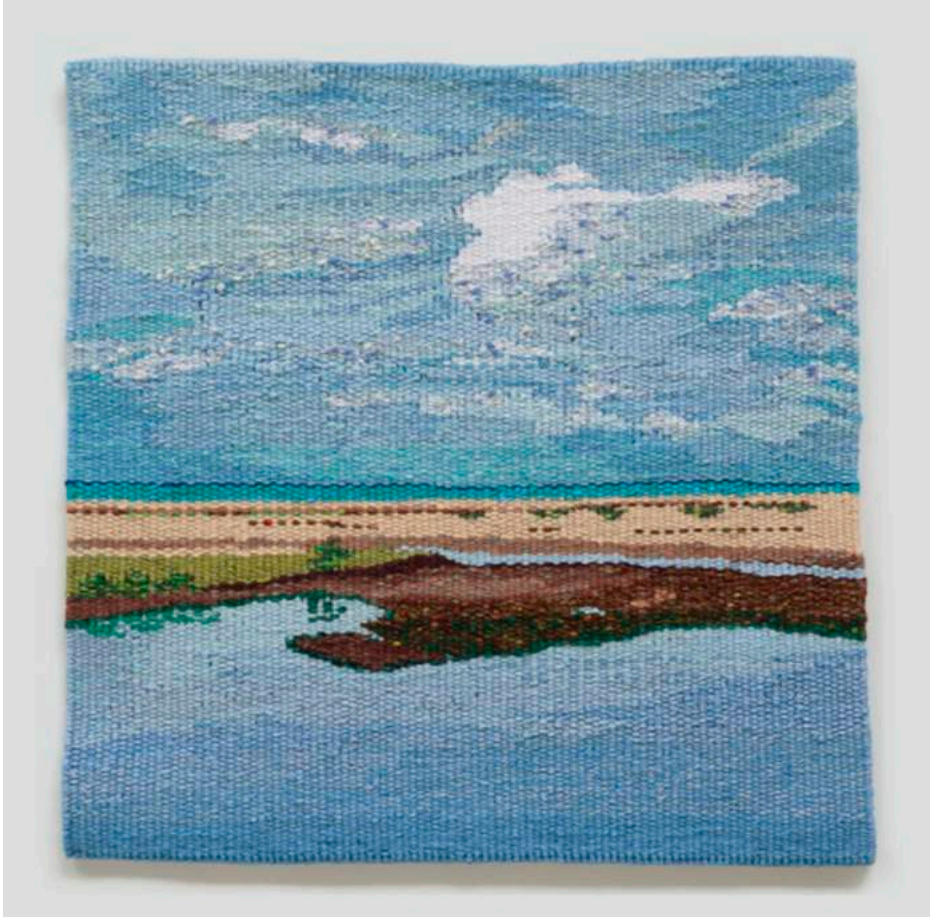
Kalpitiya View , 2017, Tapestry, 30cm x 30cm